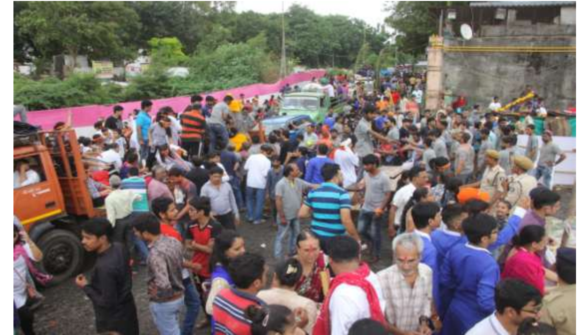
Line for Ganesh Visarjan on Site