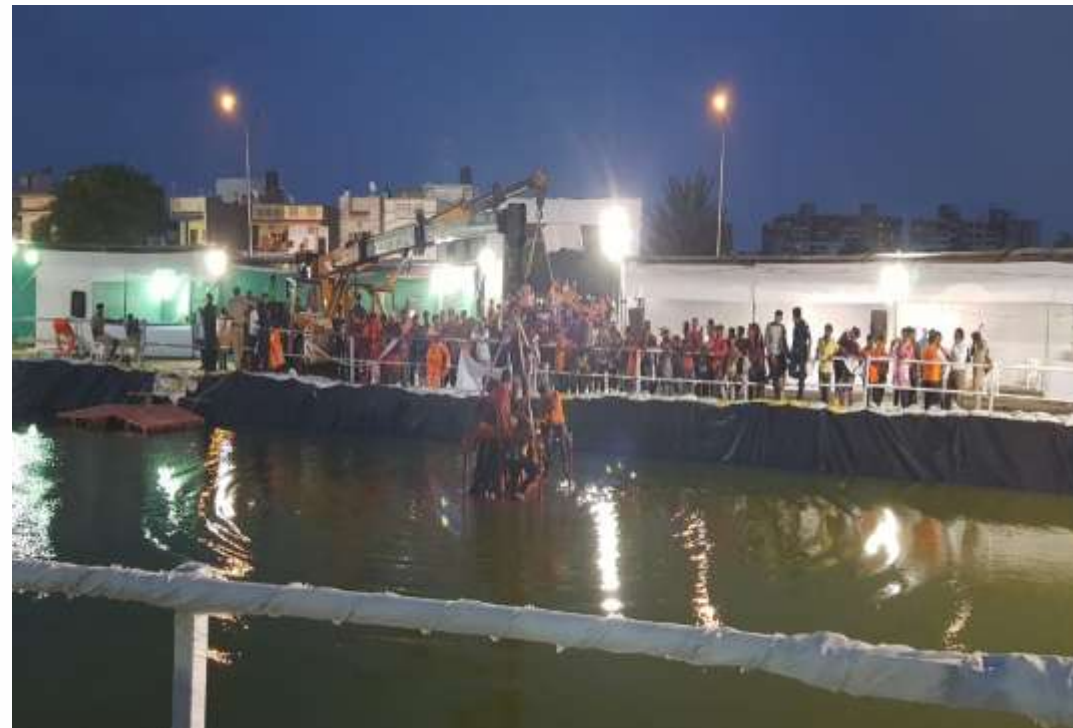
Ganesh Visarjan through Crane