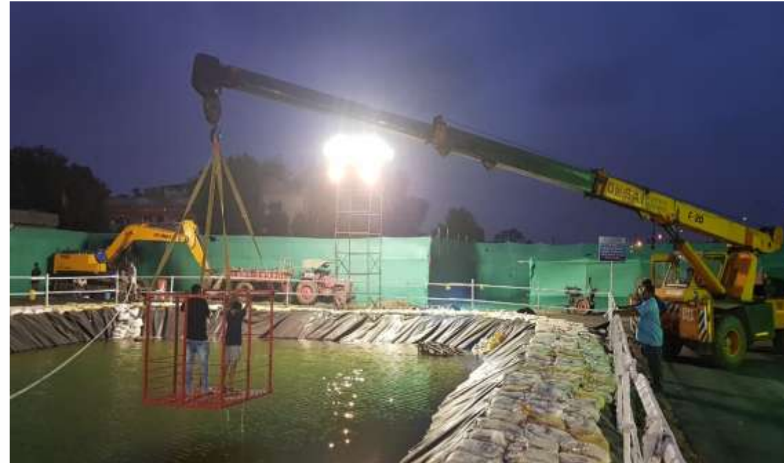
Demo Drill of Visarjan