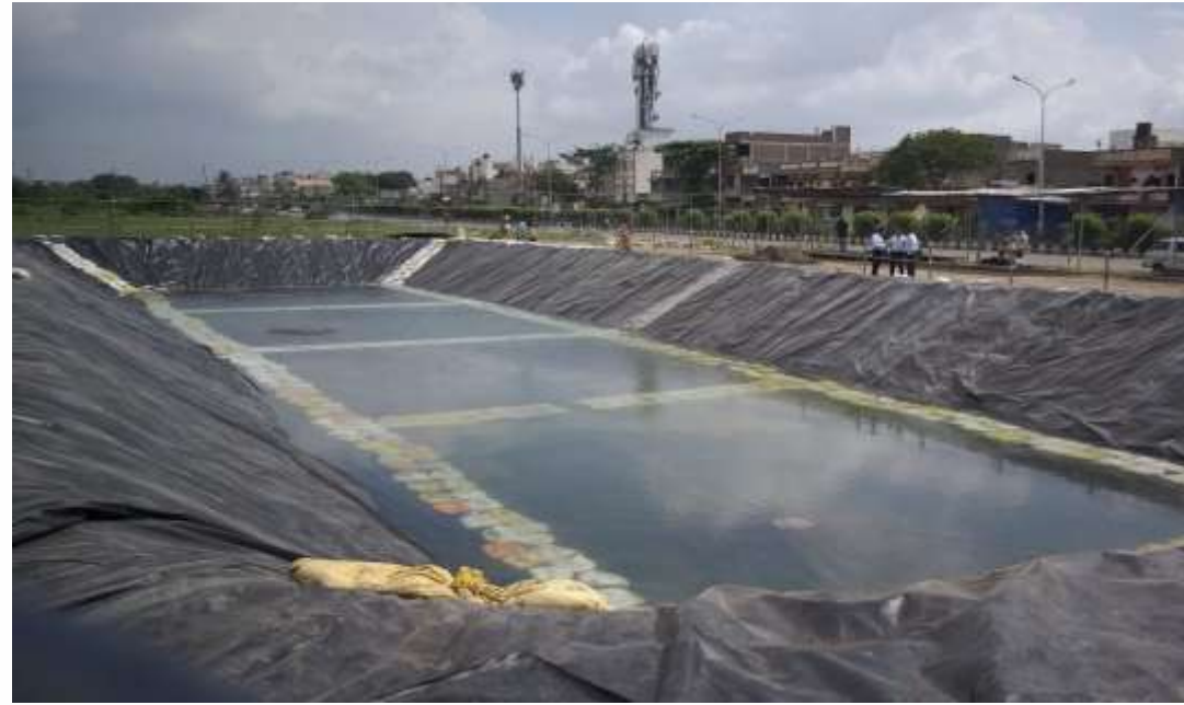
Artificial Pond with Water