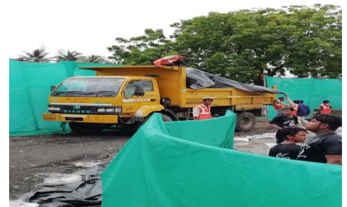
Murti transfer into Other area